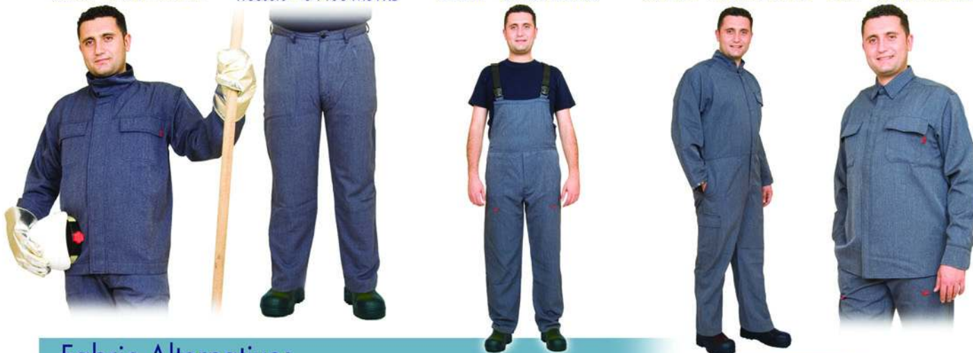
PROTEK® METALSTAR Shirt – 83909 MSVKD